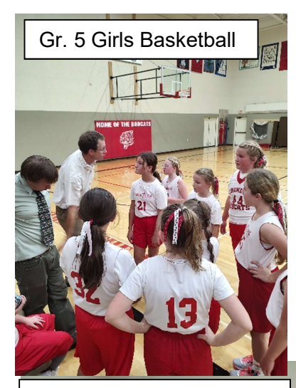
Gr. 7 & 8 Girls Basketball