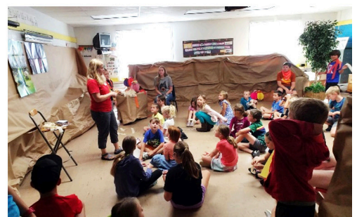
A Monumental VBS with over 220 kids at Trinity School!