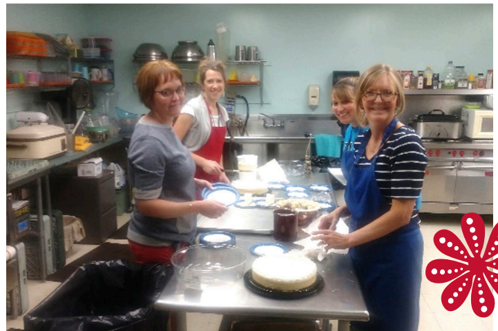
School Teachers Handling Hosting Duties