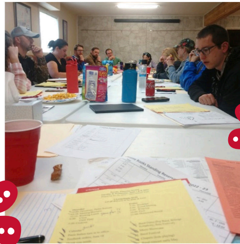
Staff Planning Retreat