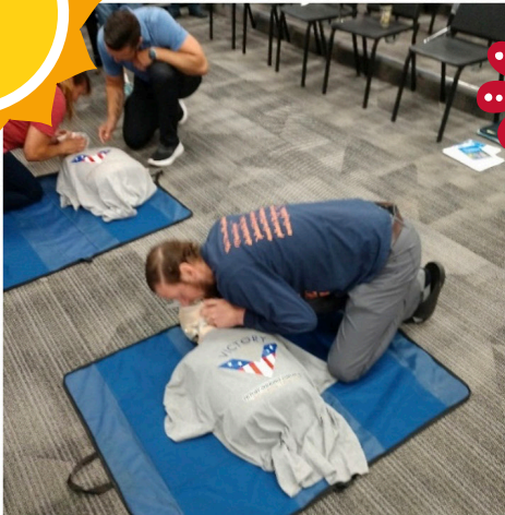
Staff CPR Training