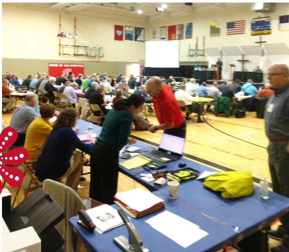
MT District Convention at Trinity School