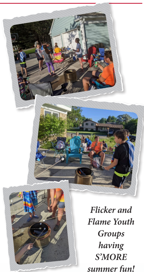
Flicker and Flame Youth Groups having S'MORE summer fun!

If you'd like to follow along with us, you can head to our social media pages (@TYM Billings on Instagram and Facebook), search #GETFOUND22 on Facebook or Instagram, or head to the LCMS Youth Ministry Website ( www.lcmsgathering.com ) to join us for livestreams of the mass events and other news.