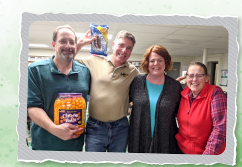
Last Place (Cheese Ball Winners): Striking Titans