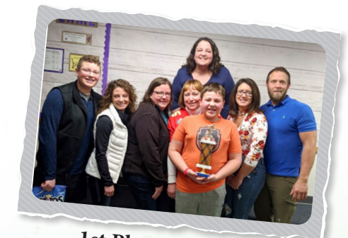
1st Place: Ski Bums